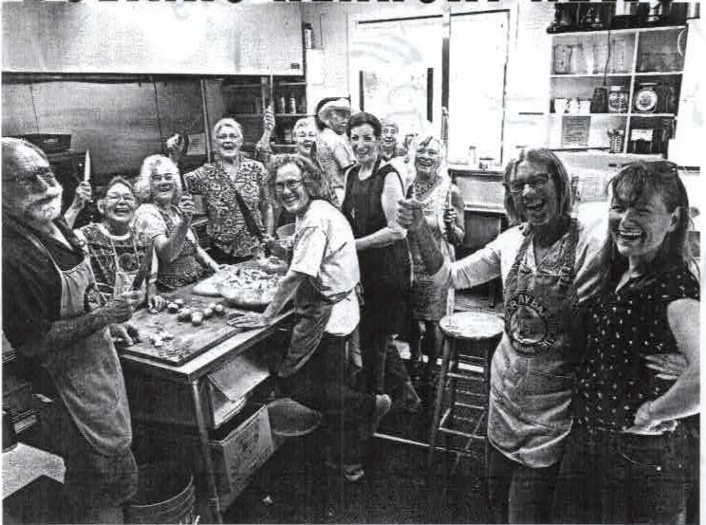
above: the Labor Day Chop at the Community Center