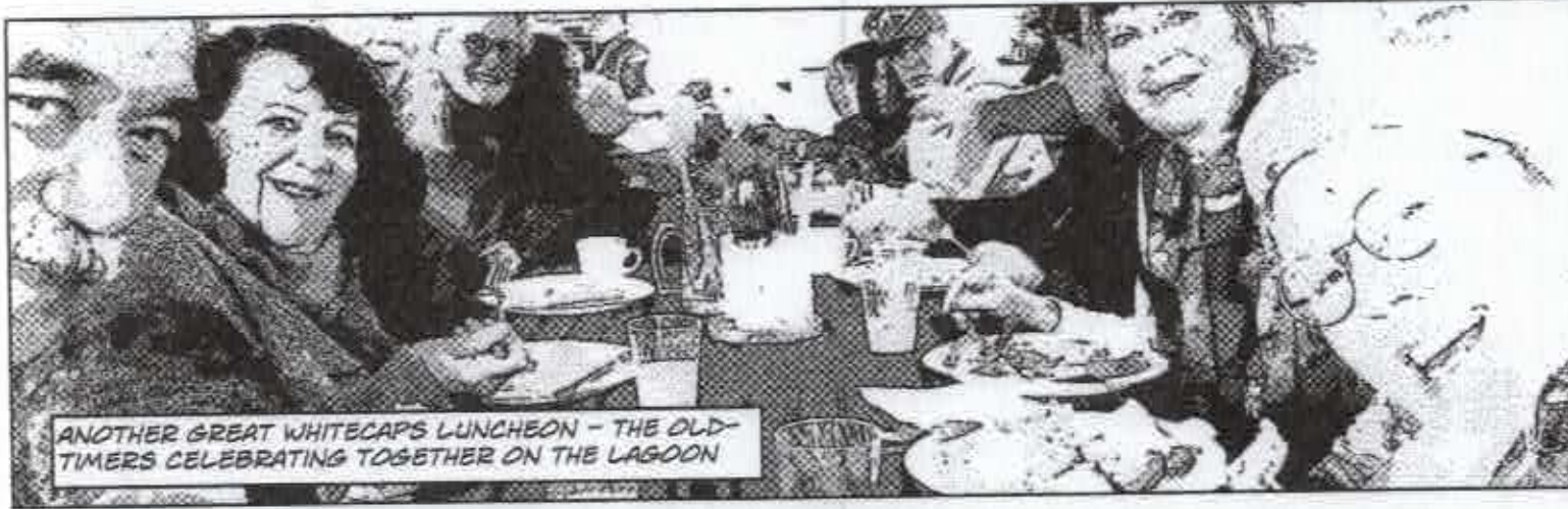
ANOTHER GREAT WHITECAPS LUNCHEON - THE OLD-TIMERS CELEBRATING TOGETHER ON THE LAGOON