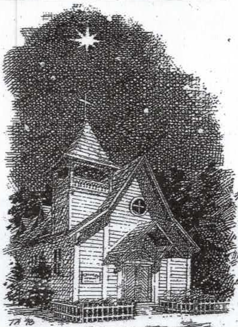
CALVARY PRESBYTERIAN CHURCH EST. 1894, BOLINAS, CALIFORNIA

"Sunday, April 1 at 12:30pm, ALL are welcome to gather for a Town Picture, in front of our town's Historic Calvary Church! Dress up! Food served afterwards."