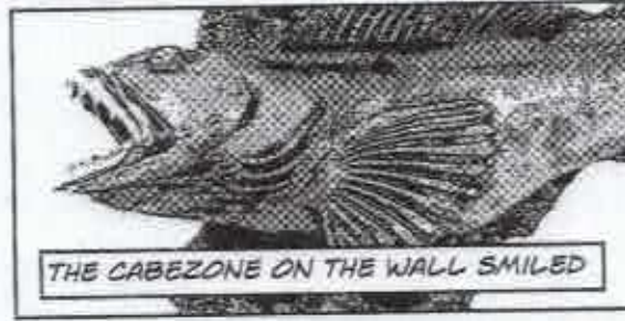
THE CABEZONE ON THE WALL SMILED