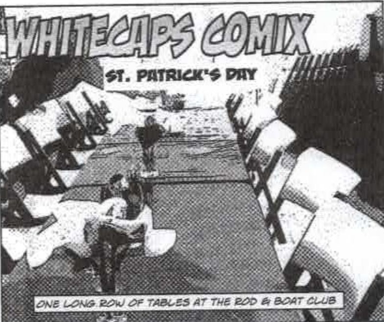
ONE LONG ROW OF TABLES AT THE ROD & BOAT CLUB