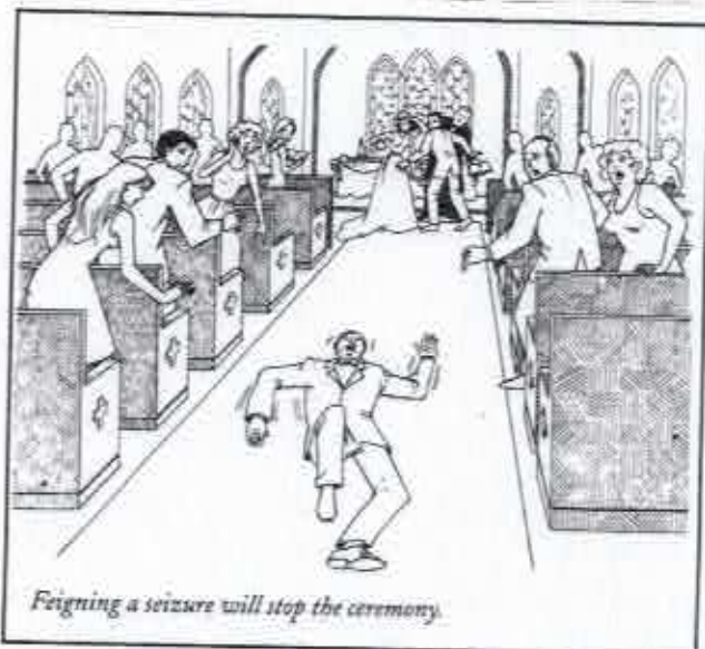
Feigning a seizure will stop the ceremony.

Another pungent smell Now permeates the room; When their leftovers fell, Mess mixed new, strange perfume Meal done, both crawl away, Like Service Monkey crew With work done; Time to play! Sloshed, crawl off two-by-two.