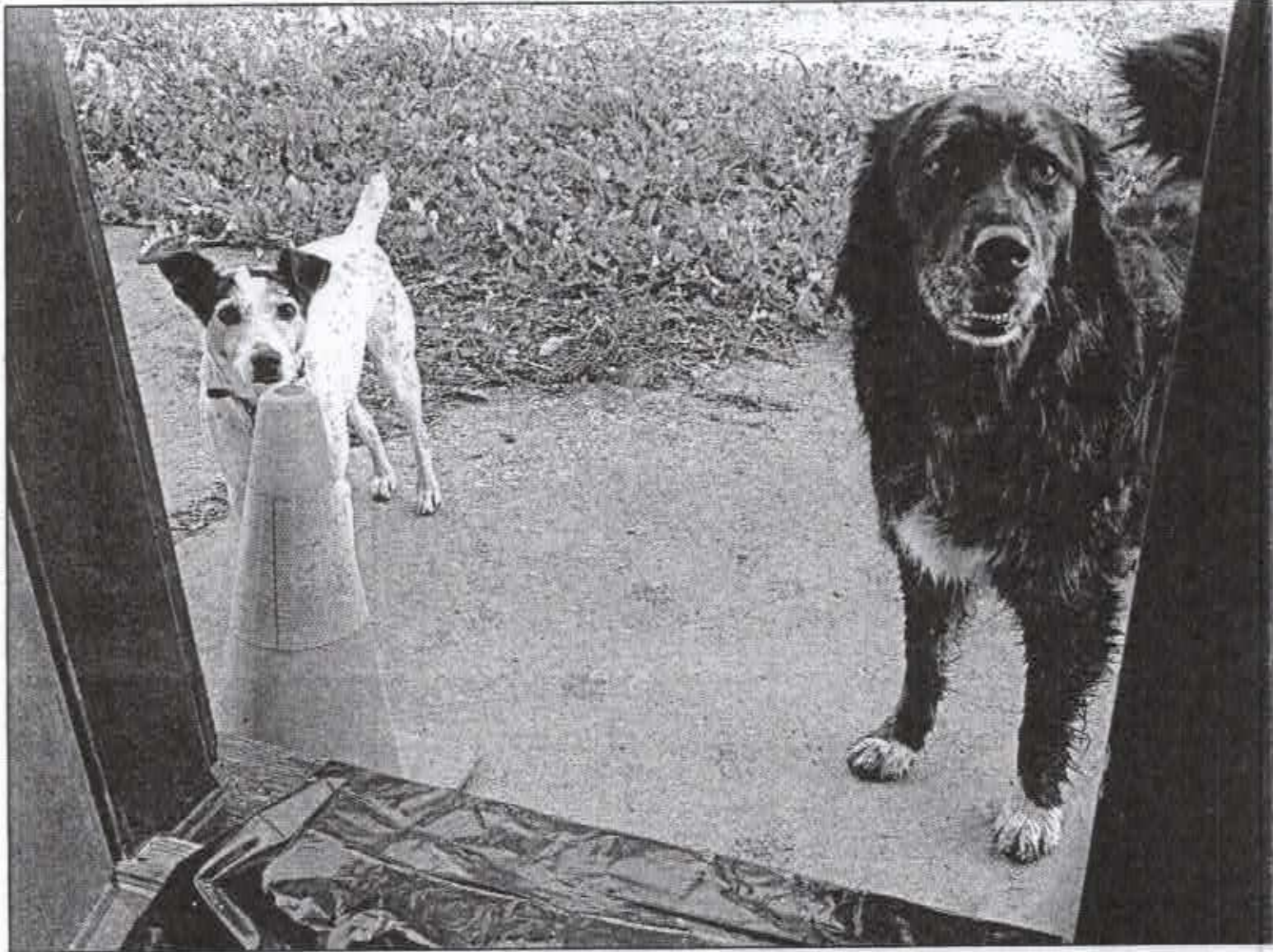
Couple of Hearsay regulars "You Delivering?"