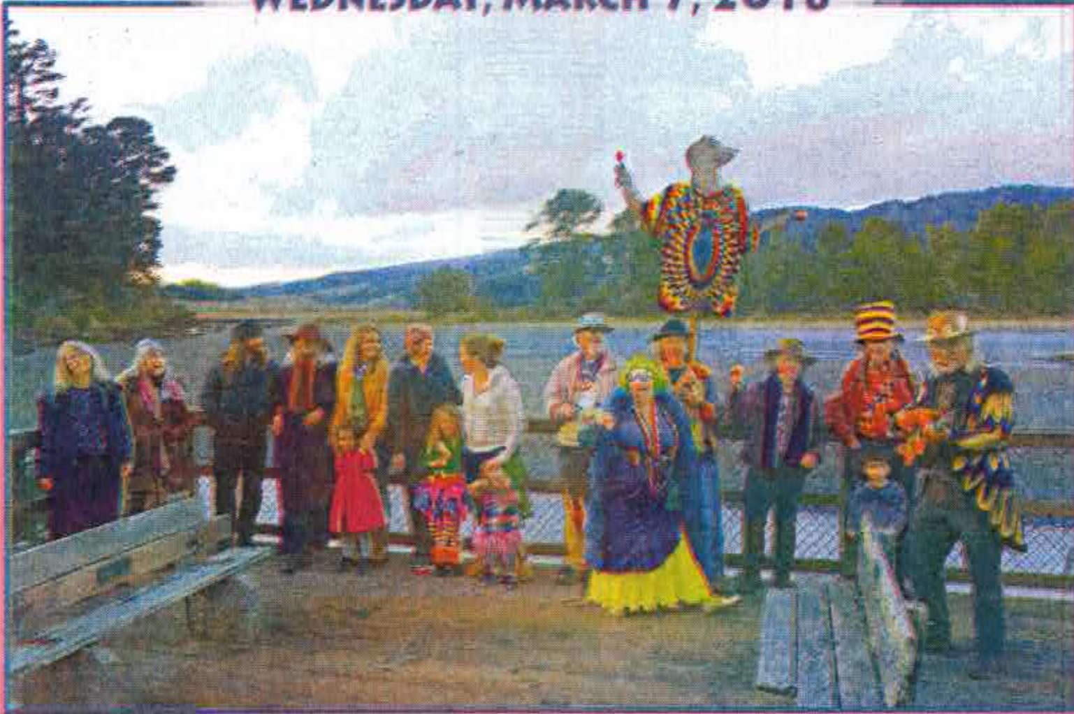
(photo above) the Hearty, Tardy Mardi Gras Parade parties at the Boat Dock