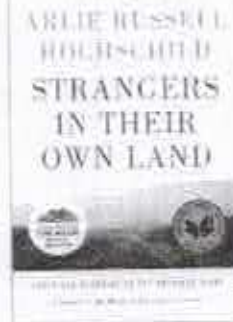
One Book One Marin Official 2018 Selection