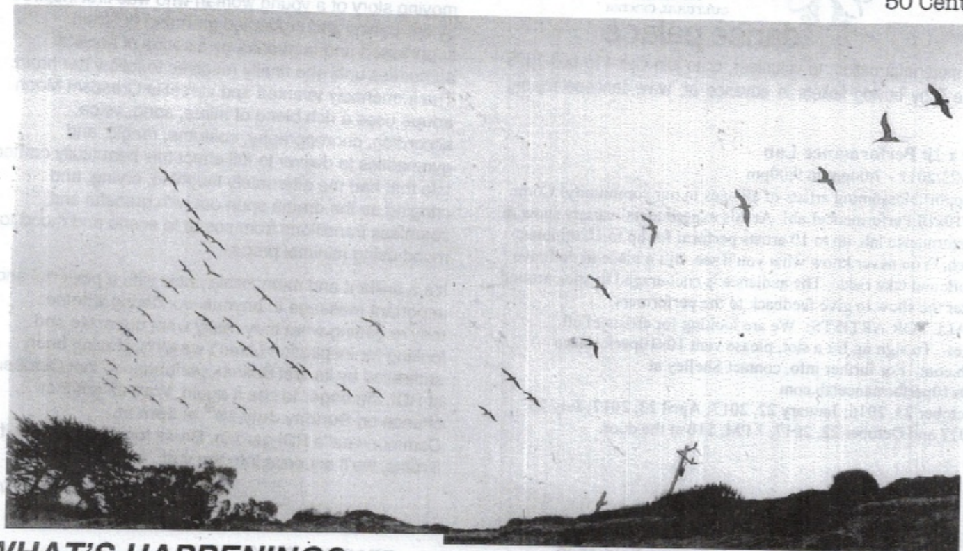
Soaring pelicans