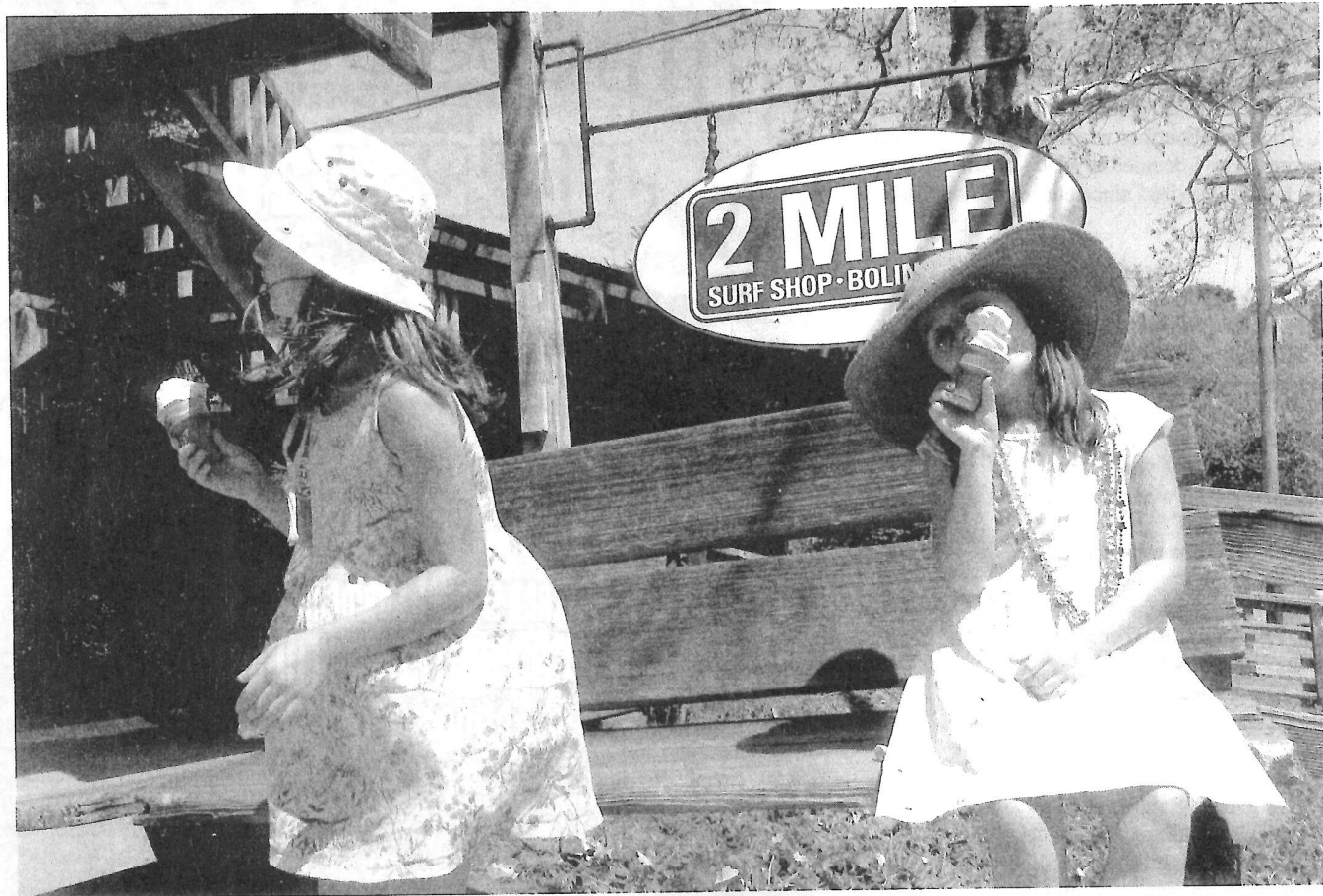
Summer frocks & ice-cream at the Bookstore.