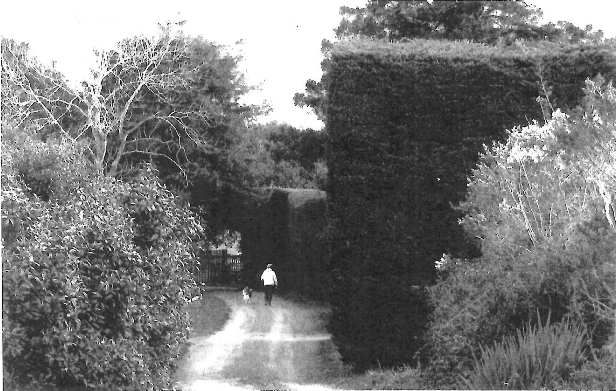
Little Mesa, big hedge.