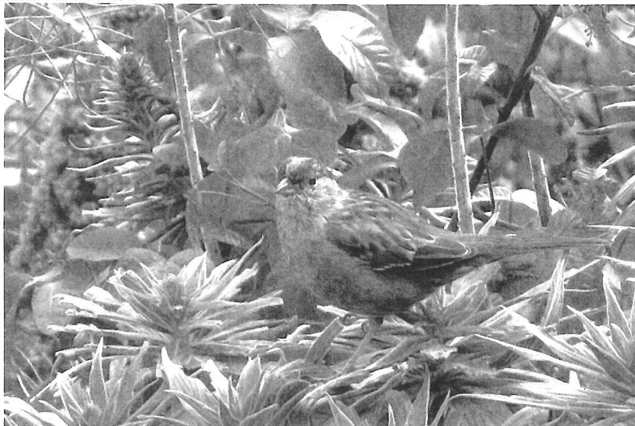
Spring Wildlife in the Garden. Don't forget the upcoming Art & Gardens event at the Community Center.