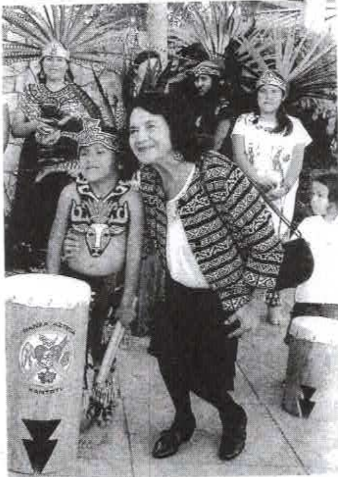
Dolores Huerta with The Young Aztec Dancers in Petaluma, circa 2014.