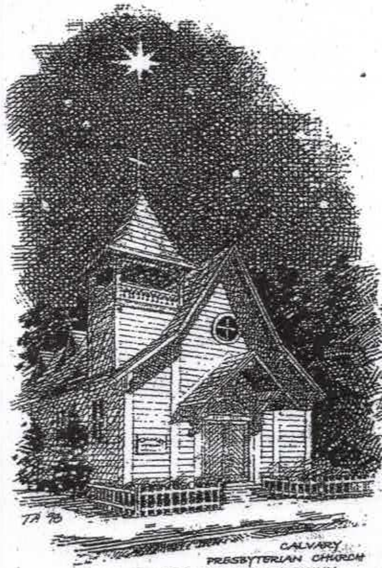
CALVARY PRESBYTERIAN CHURCH EST. 1876, BOLINAS, CALIFORNIA

Gallery Route One and Artists Beyond Boundaries present a free film screening and discussion of "Sittwe" by filmmaker Jeanne Hallacy. This screening is part of the Speaking Out exhibition at Gallery Route One which features nine contemporary Myanmar artists exploring urgent issues facing their country today. Call (415) 663-1347 for more information.