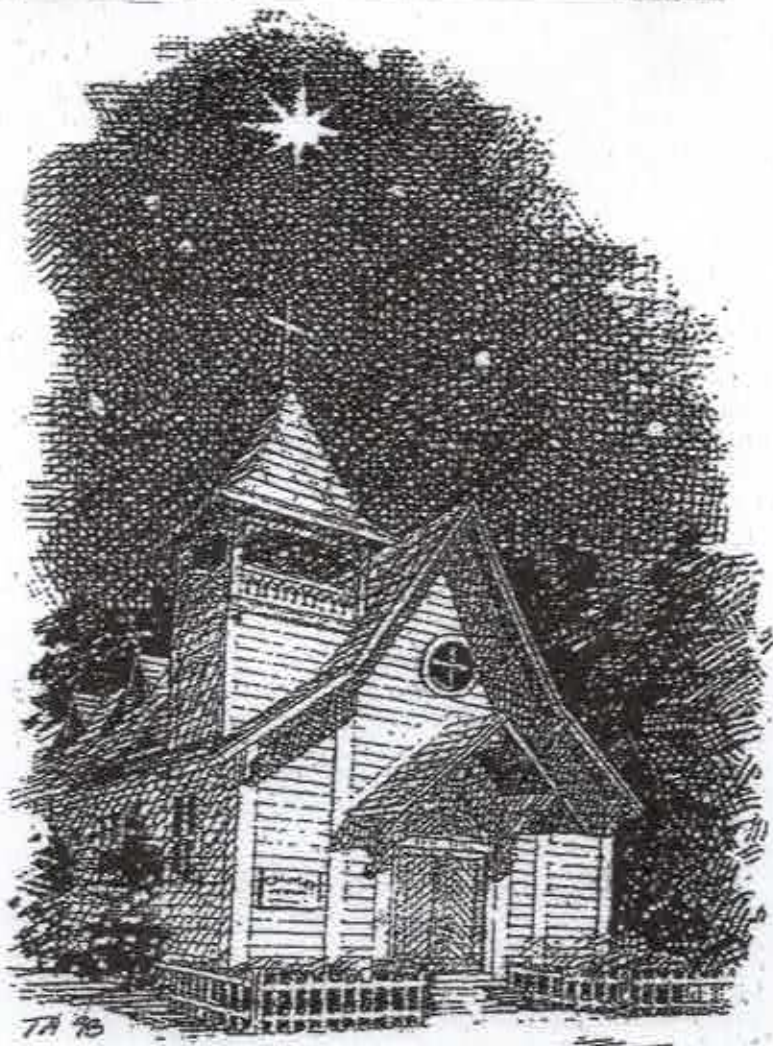
CALVARY PRESBYTERIAN CHURCH EST. 1891, BOLINAS, CALIFORNIA