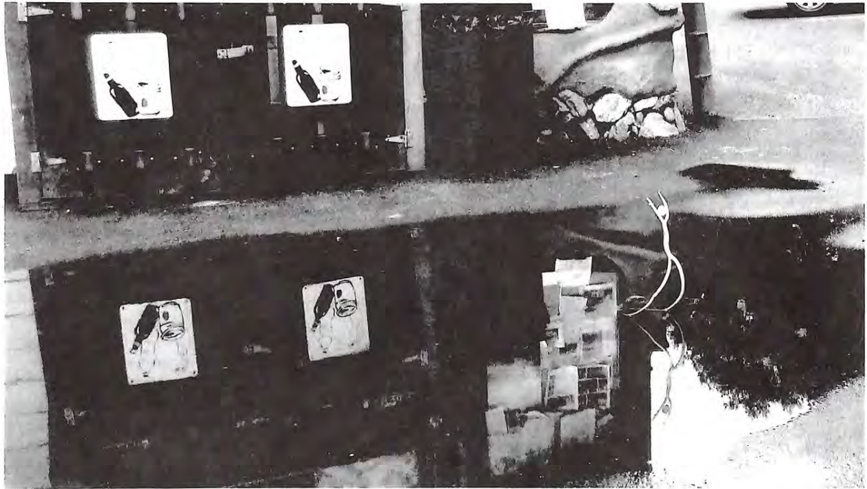
Puddle Play in the Plaza.