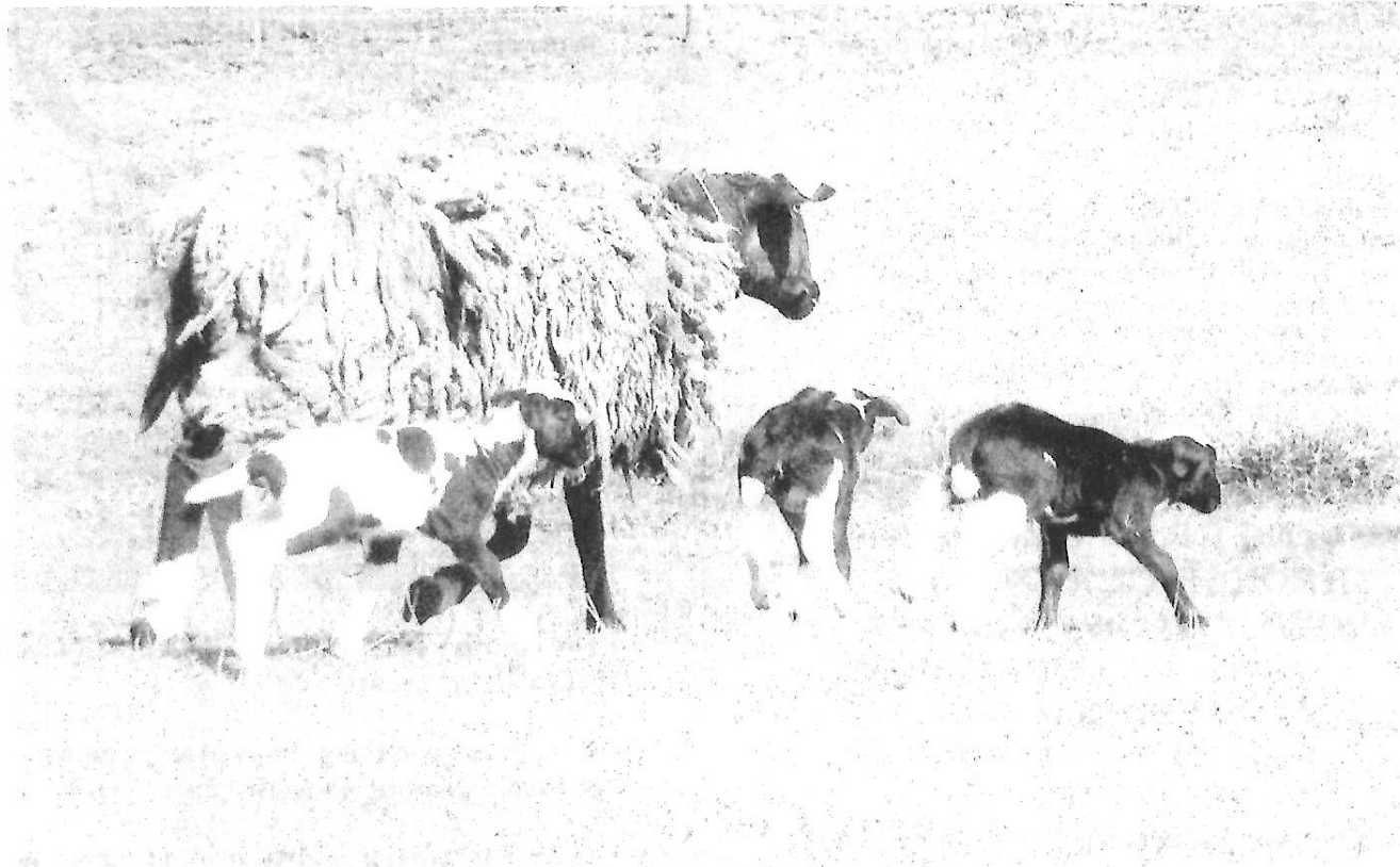
Hottest gambolling spot in town: Woodville Ranch.