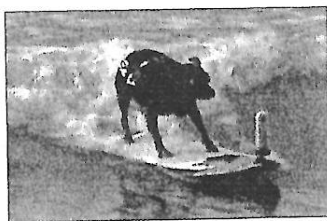
Chasing waves, not cats