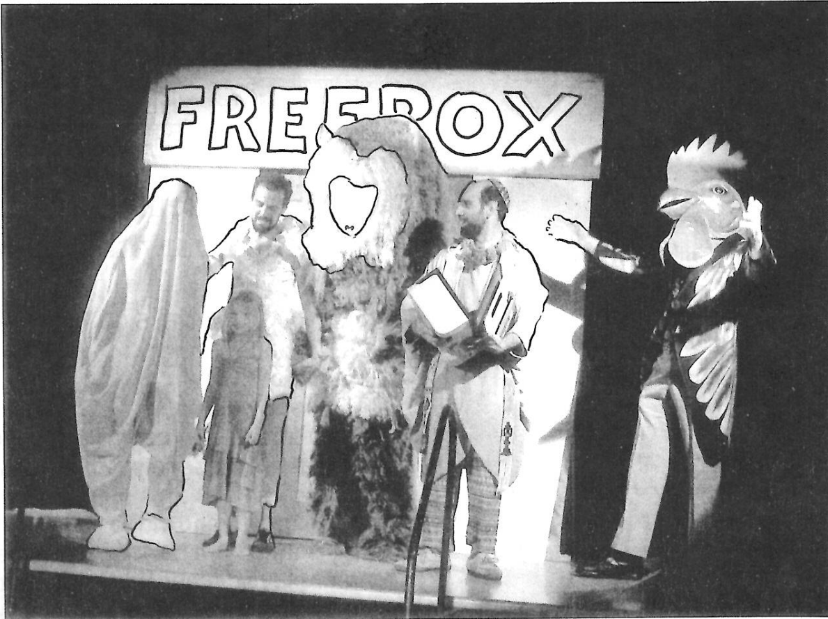
The Interspecies Wedding Ceremony at Saturday's Free Box Follies.